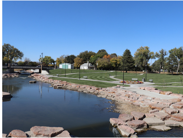
Johnson Park in Norfolk – 2019 Planning Award, 2020 Construction Award