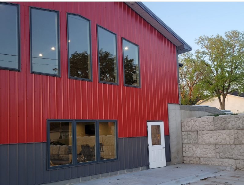
Pickrell Community Center – 2023 Construction Award