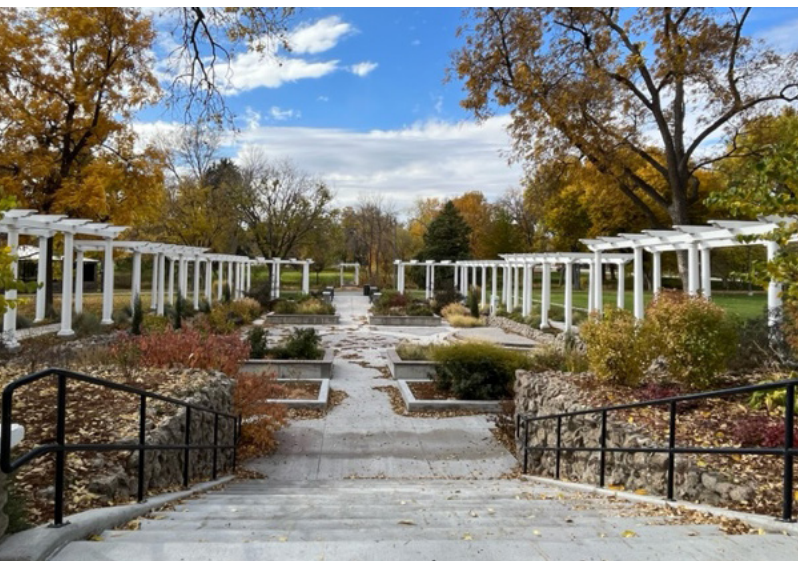
Sunken Gardens in Alliance – 2019 Planning Award, 2020 Construction Award

Scan the QR Code below for the latest info on the CCCF Program