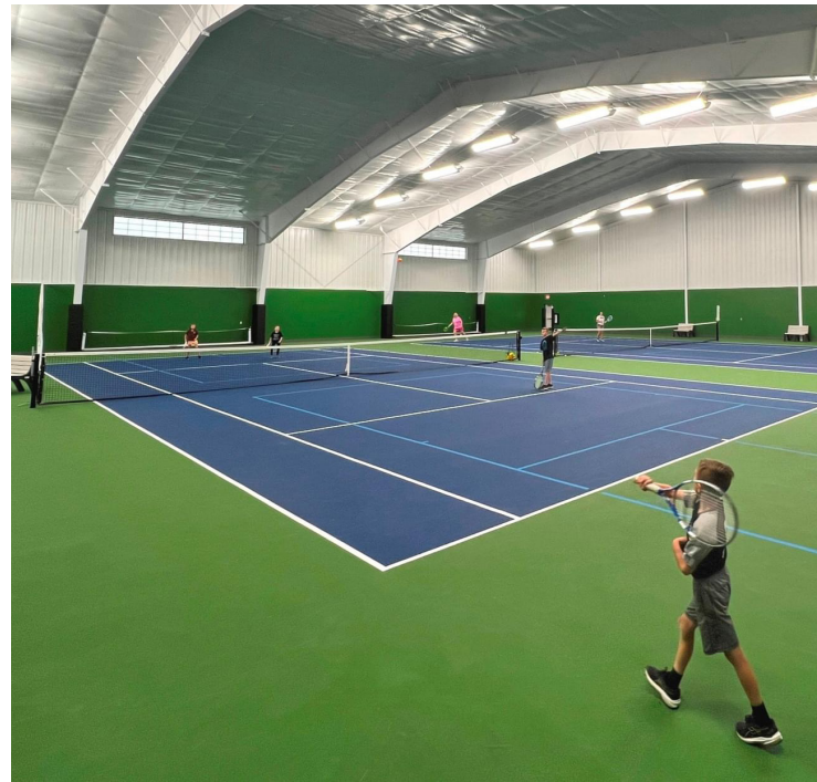
Lexington Racquet Center – 2020 Planning Award, 2022 Construction Award