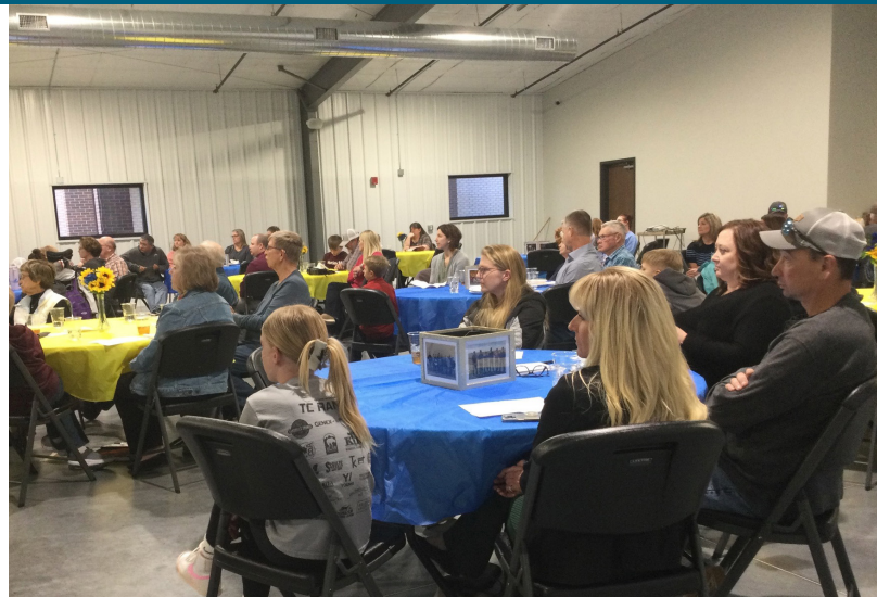
Roseland Community Center – 2016 Planning Award, 2020 Construction Award