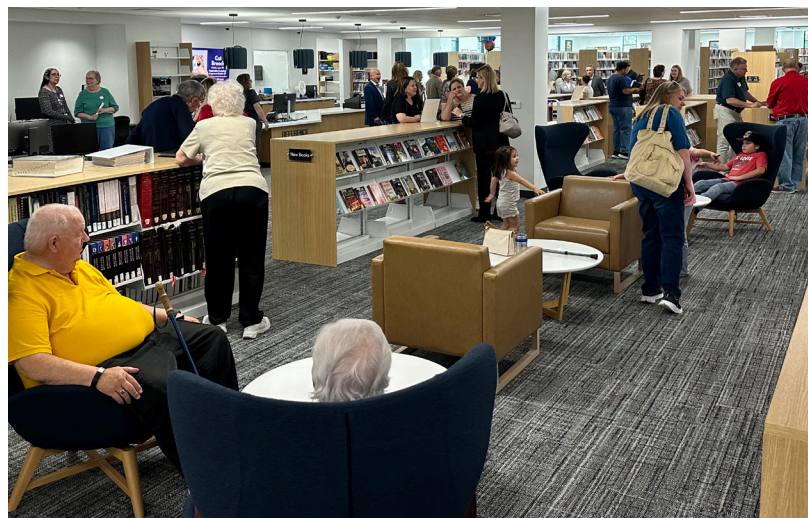
Bellevue Public Library – 2022 Construction Award