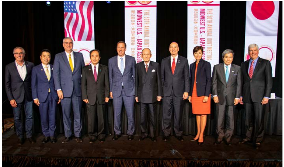
▲ Governors meet at the Midwest U.S.-Japan Association Conference in Omaha.

Nebraska's value of exported goods grew by over 20% between 2010 and 2017.