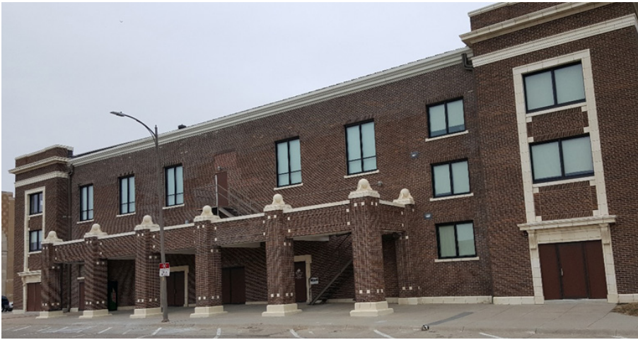
▲ CCCFF funding provided needed upgrades to the Hastings Auditorium air-conditioning and ventilation system.