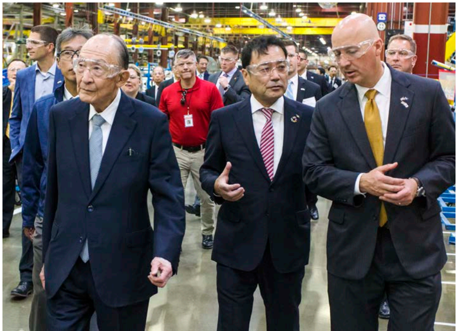
▲ Governor Ricketts and conference attendees tour Kawasaki in Lincoln.