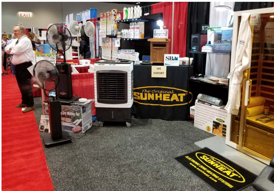
▲ STEP recipient SUNHEAT International used funding to attend domestic international trade shows to market their international product lines.

DED committed an additional $26,900 in STEP funds toward contracts with the Nebraska Business Development Center and the University of Nebraska at Omaha. This will facilitate new international market research to further assist small businesses in enhancing their export sales growth.