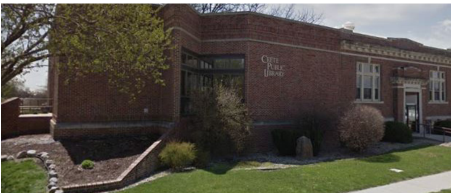
▲ CCCFF-supported additions to the Crete Public Library created a community center and storm shelter.

“The community is ecstatic about the new library facility. As anticipated, the library has had a tremendous increase in usage and new patron enrollments.”