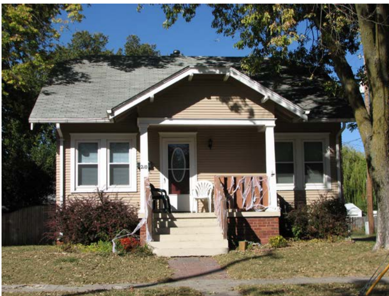
▲ Home in Fremont rehabilitated using CDBG funds.

Projects eligible for CDBG funding are those that meet one of three national program objectives: benefit low- and moderate-income persons, prevent or eliminate slum or blight conditions, or solve