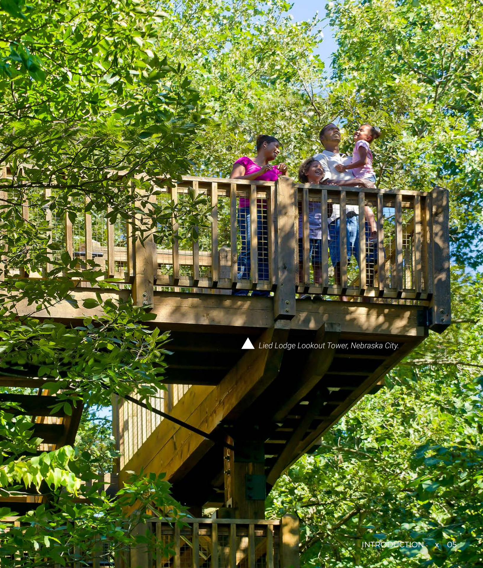
▲ Lied Lodge Lookout Tower, Nebraska City.