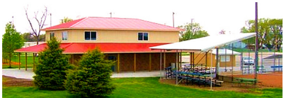
▲ CDAA tax credits supported fundraising for the Scribner-Snyder Youth Sports Center in Scribner.