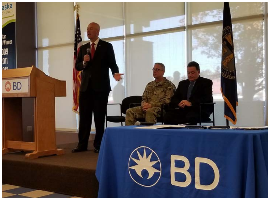
▲ Governor Ricketts thanks Becton Dickinson for their continuing investment and expansion in Nebraska.

In FY 2018-2019, our Business Development specialists helped create approximately 1,527 jobs by spearheading business attraction and expansion projects that targeted great companies. These jobs had an average annual wage of $46,955 — 2.4% higher than the overall state average wage for 2018.