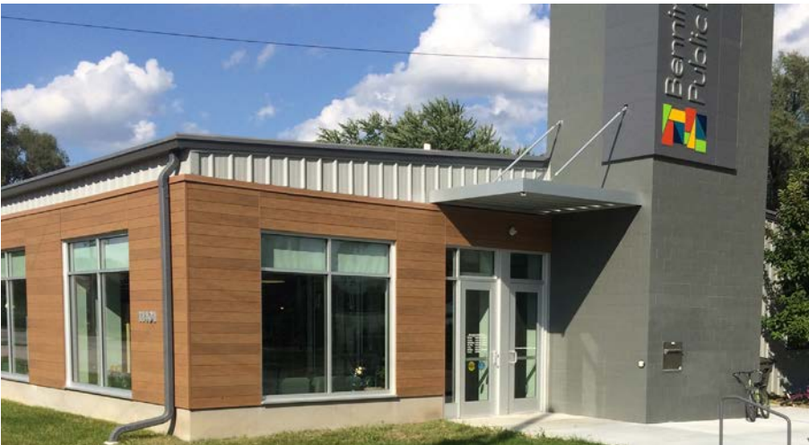
▲ The CCCFF-funded Bennington Public Library opened its doors April 16, 2018.