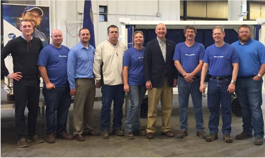
▲ Governor Ricketts attends a ribbon cutting for FAST Global Solutions in Auburn.

In the process, we brought $815.5 million in new capital investment into Nebraska, and grew the state's manufacturing; agribusiness and food processing; bioscience; transportation and logistics; health and medical services; call center and e-commerce and other industries.