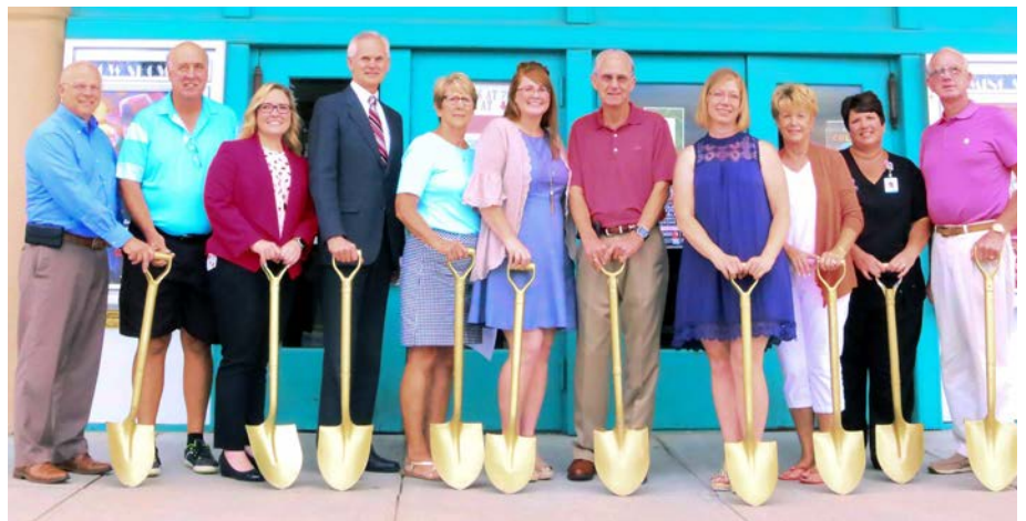
▲ Lt. Gov. Mike Foley joins Gothenburg residents for the Sun Theatre ground-breaking celebration.

In all, CDBG awards during the fiscal year leveraged $19.2 million in matching funds and supported $33 million in total project costs. The resulting projects benefitted an estimated 20,046 low- and moderate-income persons across Nebraska.