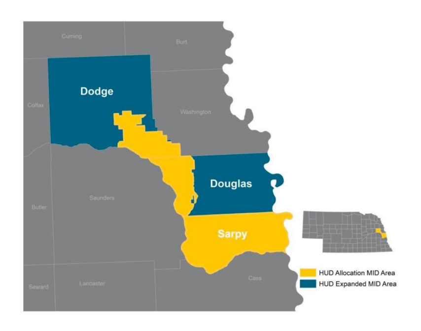
Figure 3: HUD-defined MID Areas