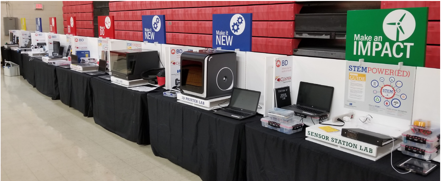
Becton Dickinson's Mobile STEM Lab, which lets students interact with manufacturing technology and equipment, has traveled to 13 Nebraska schools to date, reaching over 1,100 students.